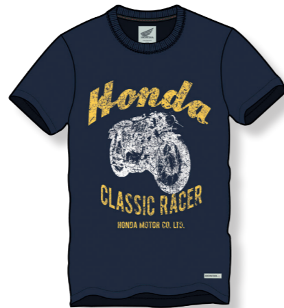
CLASSIC RACER 08HOVT167