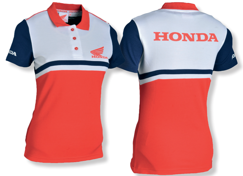
RACING POLO 2016 White/Red/Blue RPGKEPC162372 Size: S / M / L / XL