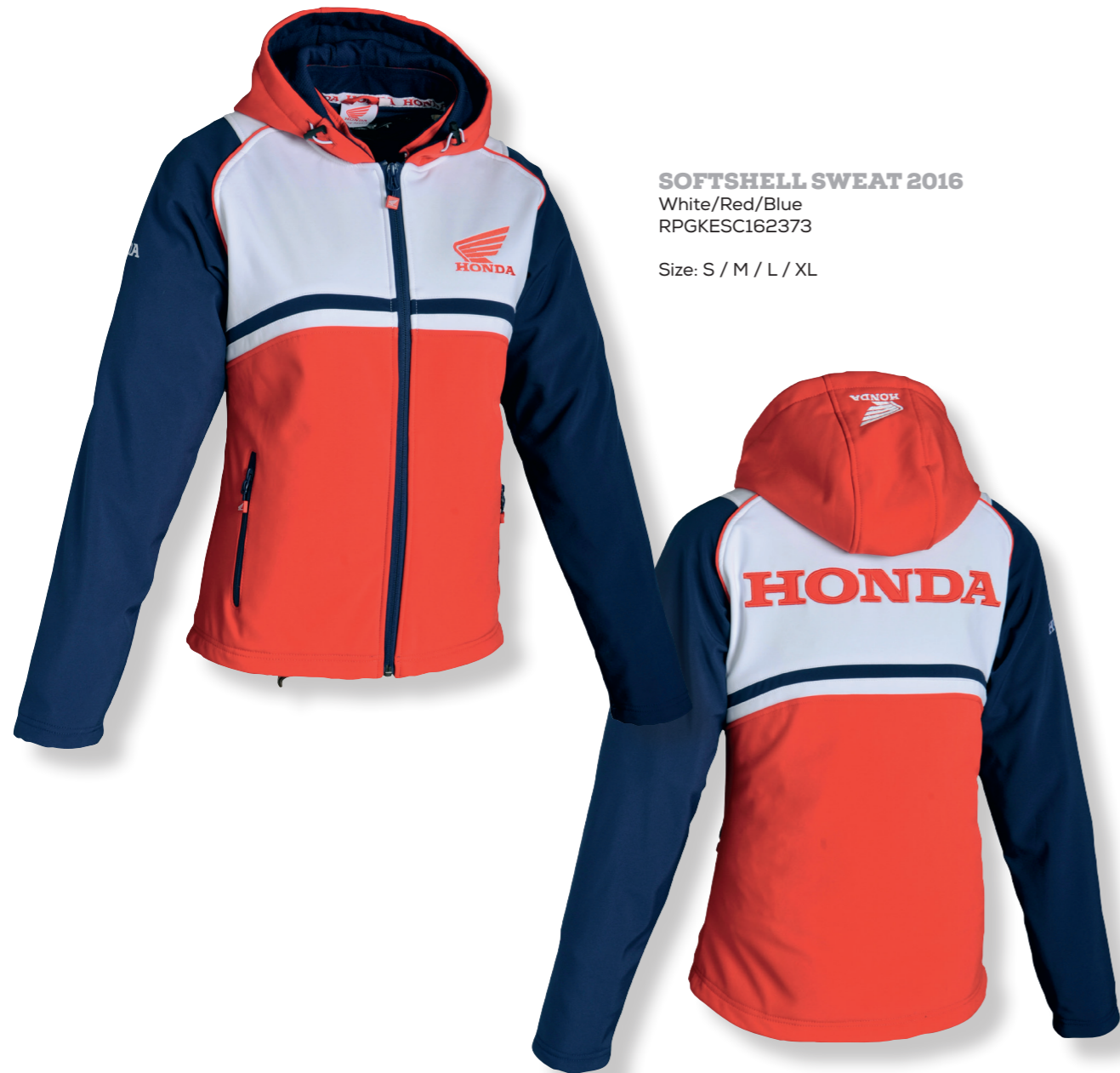
SOFTSHELL SWEAT 2016 White/Red/Blue RPGKESC162373 Size: S / M / L / XL