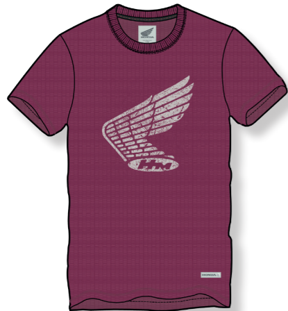
RETRO WING 08HOVT168

super-soft and highly durable Sizes: XS / S / M / L / XL / XXL