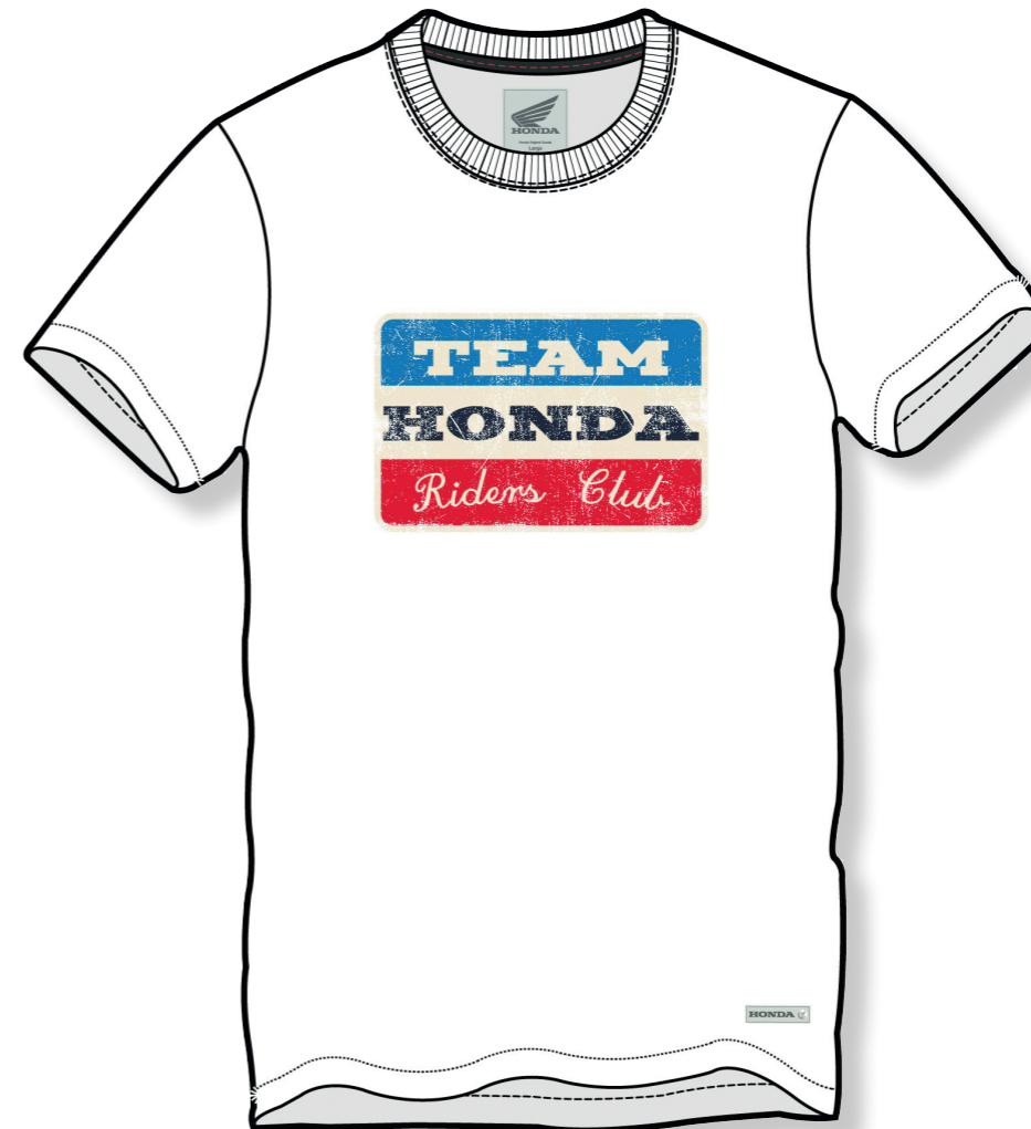
TEAM HONDA 08HOVT165