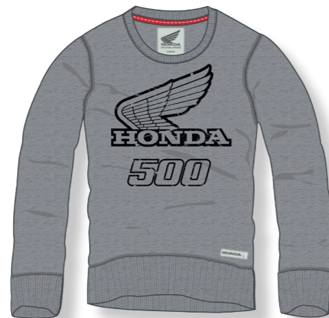
CREW SWEET 08HOVH1610