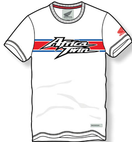
AFRICA WHITE 08HOVT1610

super-soft and highly durable Sizes: XS / S / M / L / XL / XXL