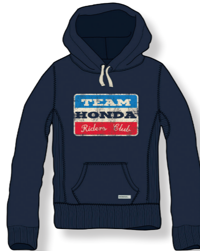
TEAM HONDA 08HOVH166