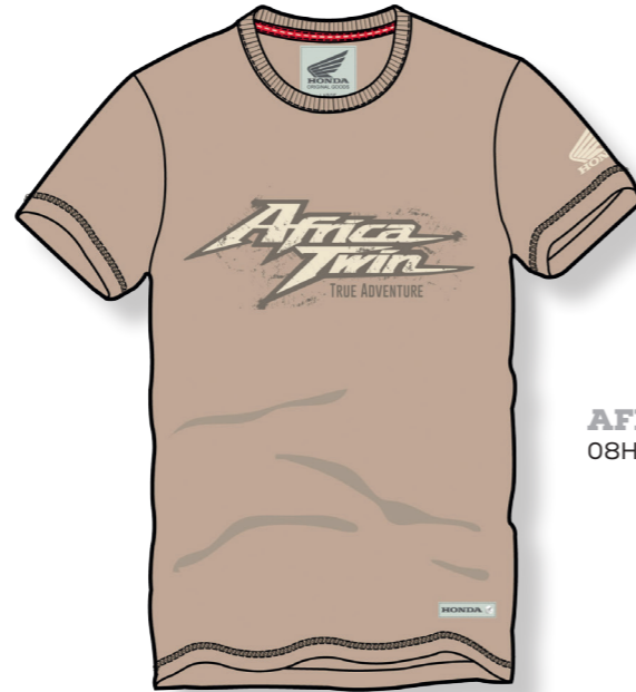
AFRICA SAND 08HOVT1611