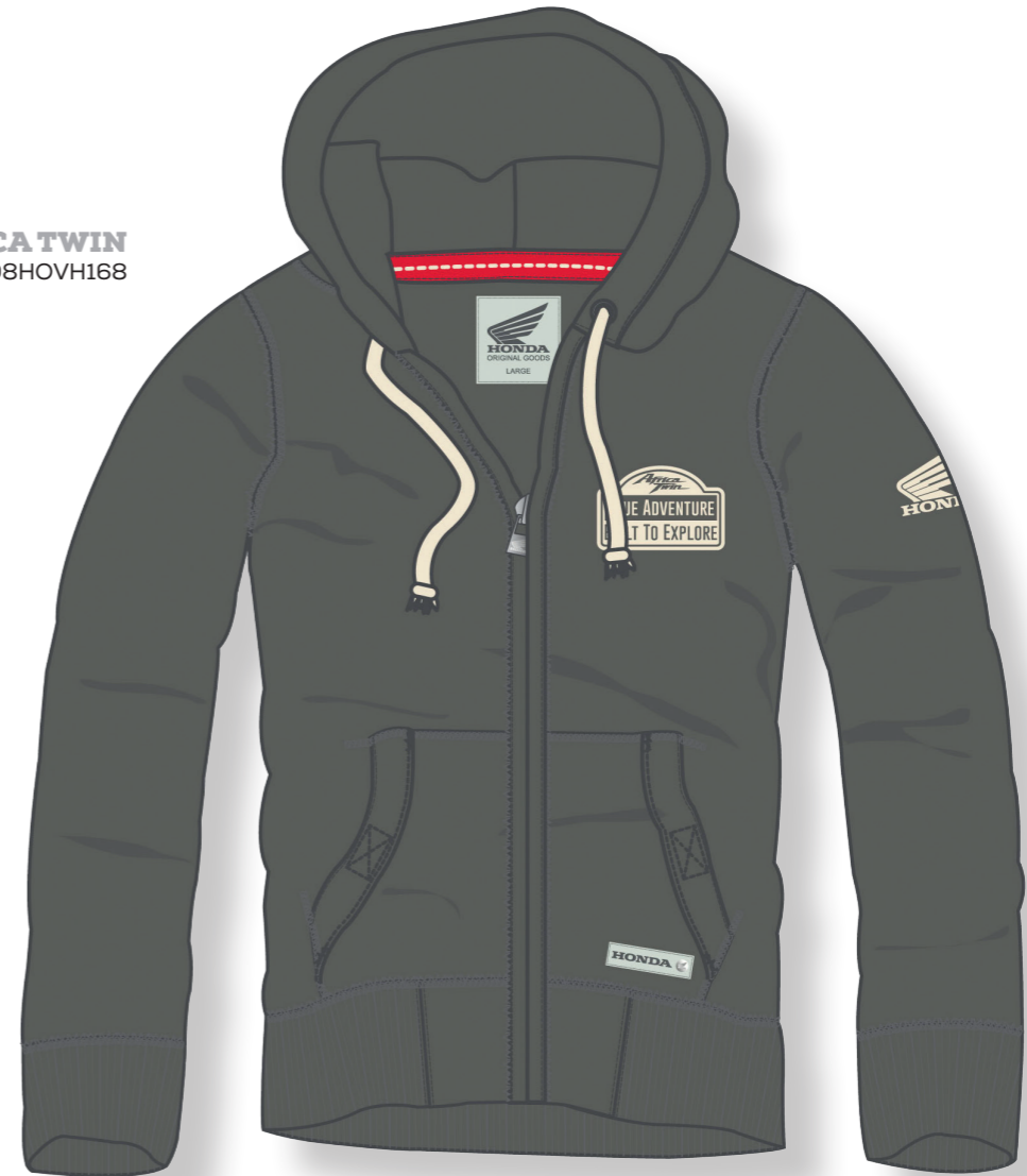
AFRICA TWIN 08HOVH168