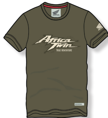
AFRICA OLIVE 08HOVT1612