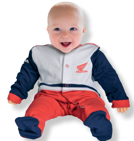
RACING ROMPERS 2016 White/Red/Blue RPGKEAC162371 Size: 6M / 12M / 24M / 36M