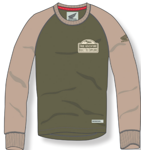
AFRICA LONG 08HOVH169