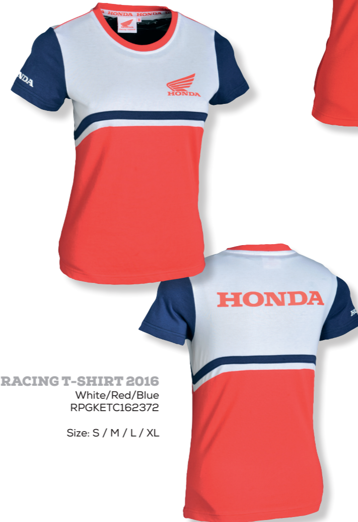
RACING T-SHIRT 2016 White/Red/Blue RPGKETC162372 Size: S / M / L / XL